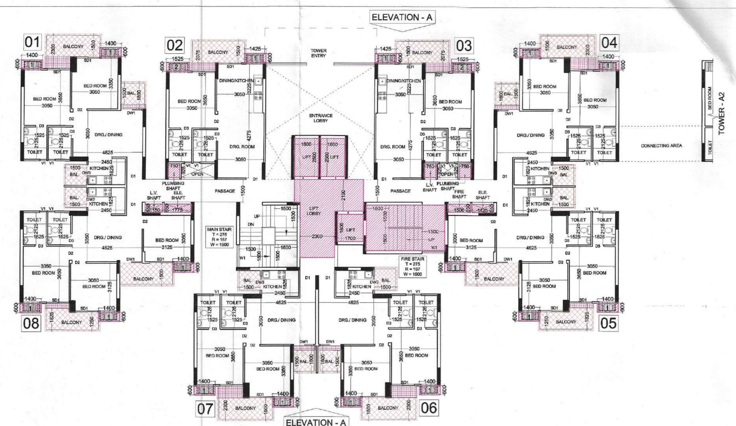
TOWER - A1 & A3 ARE SAME (MIRROR) GROUND FLOOR PLAN