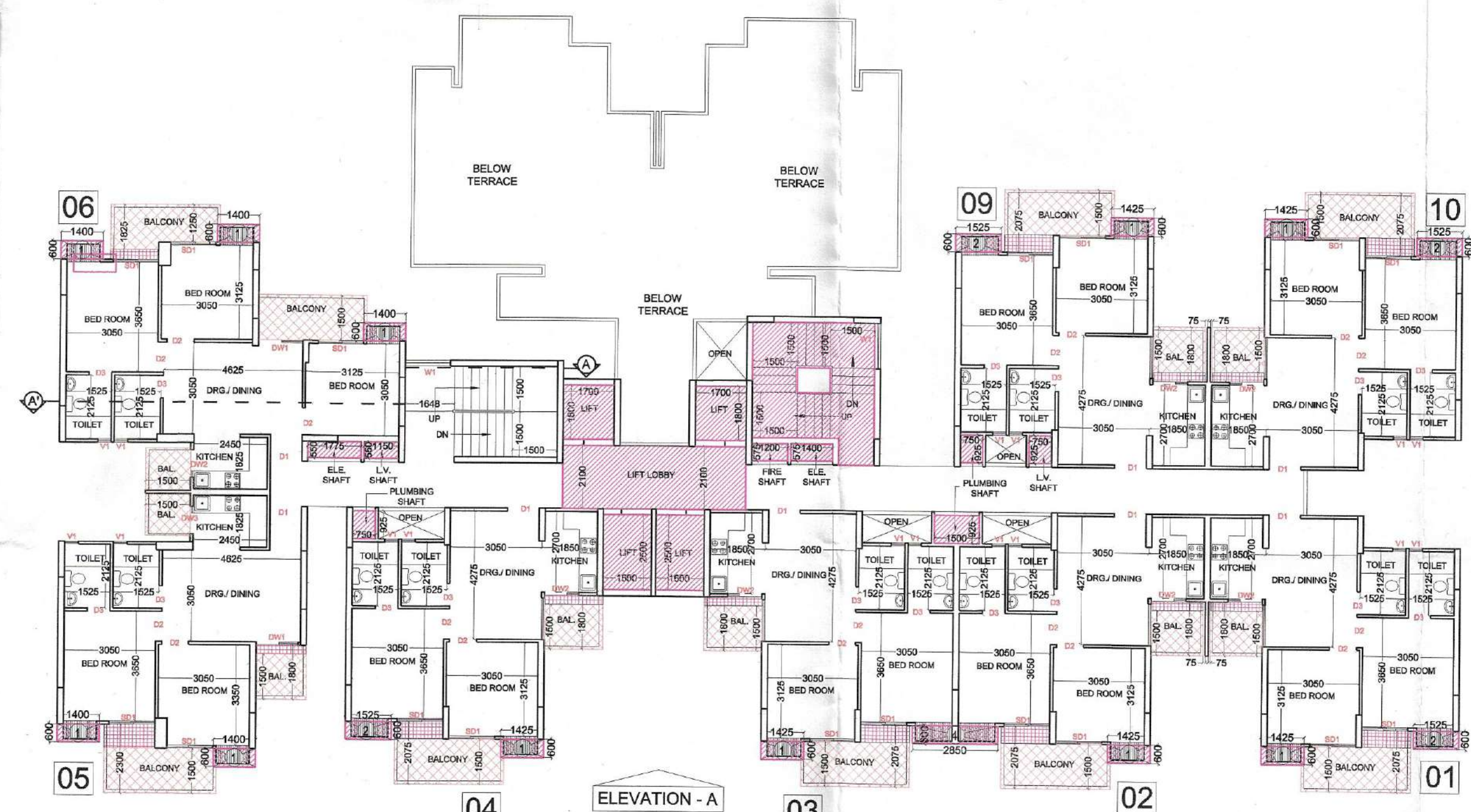
TOWER - A5 & A6 ARE SAME ( MIRROR ) 26th. & 27th. FLOOR PLAN