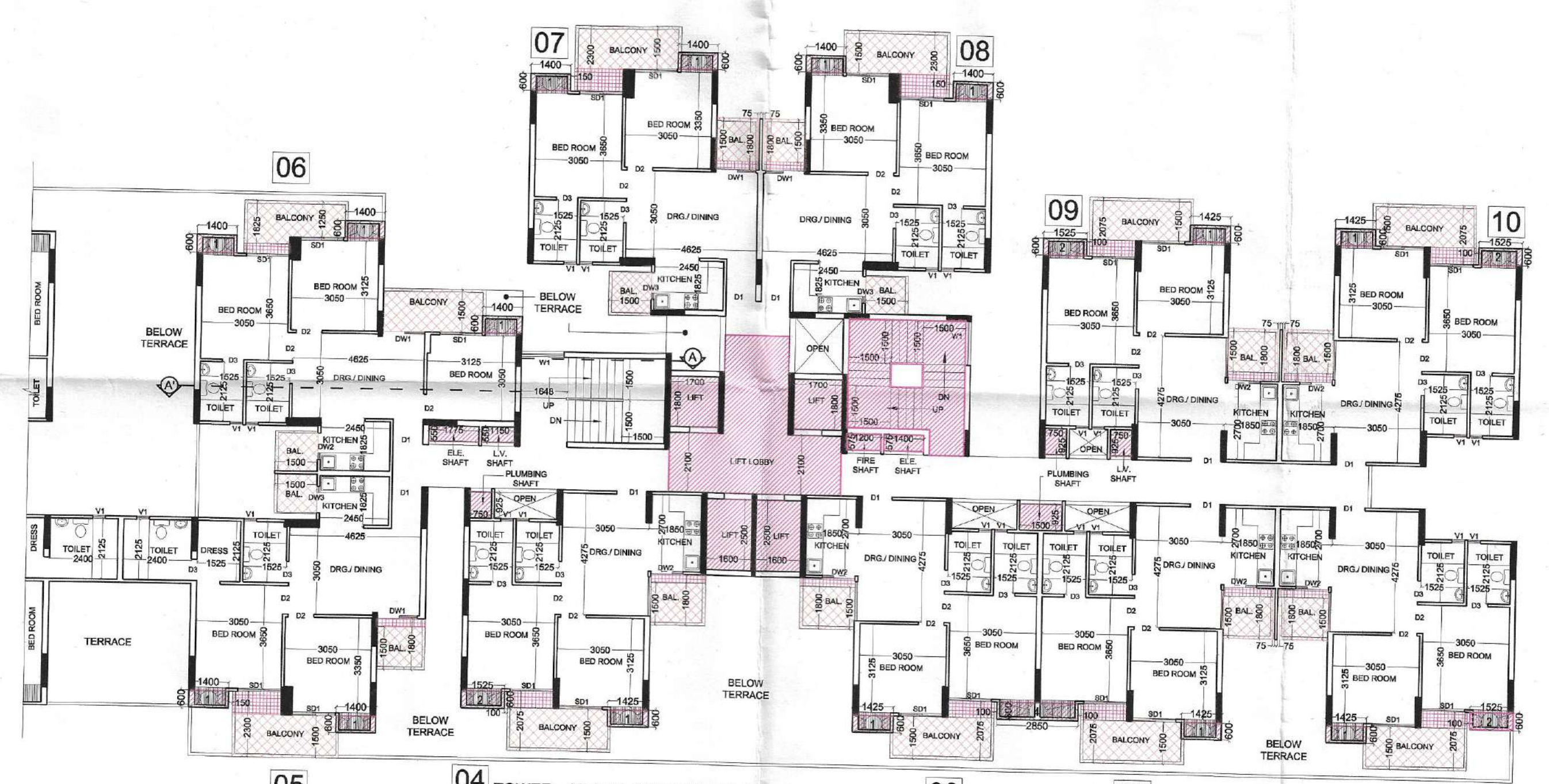
TOWER - A7 & A8 ARE SAME (MIRROR) 2nd. FLOOR PLAN