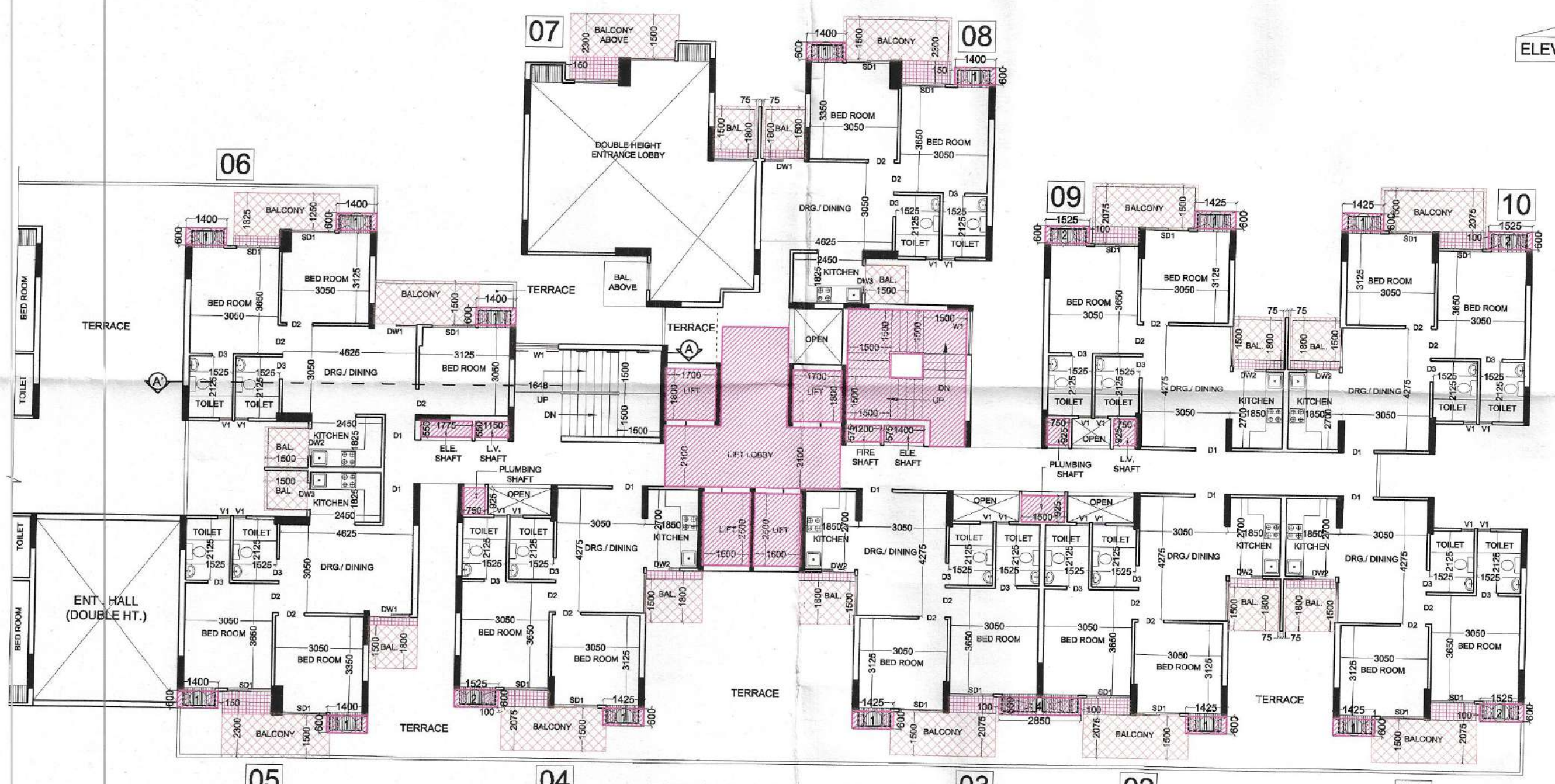
TOWER - A7 & A8 ARE SAME (MIRROR) 1st. FLOOR PLAN