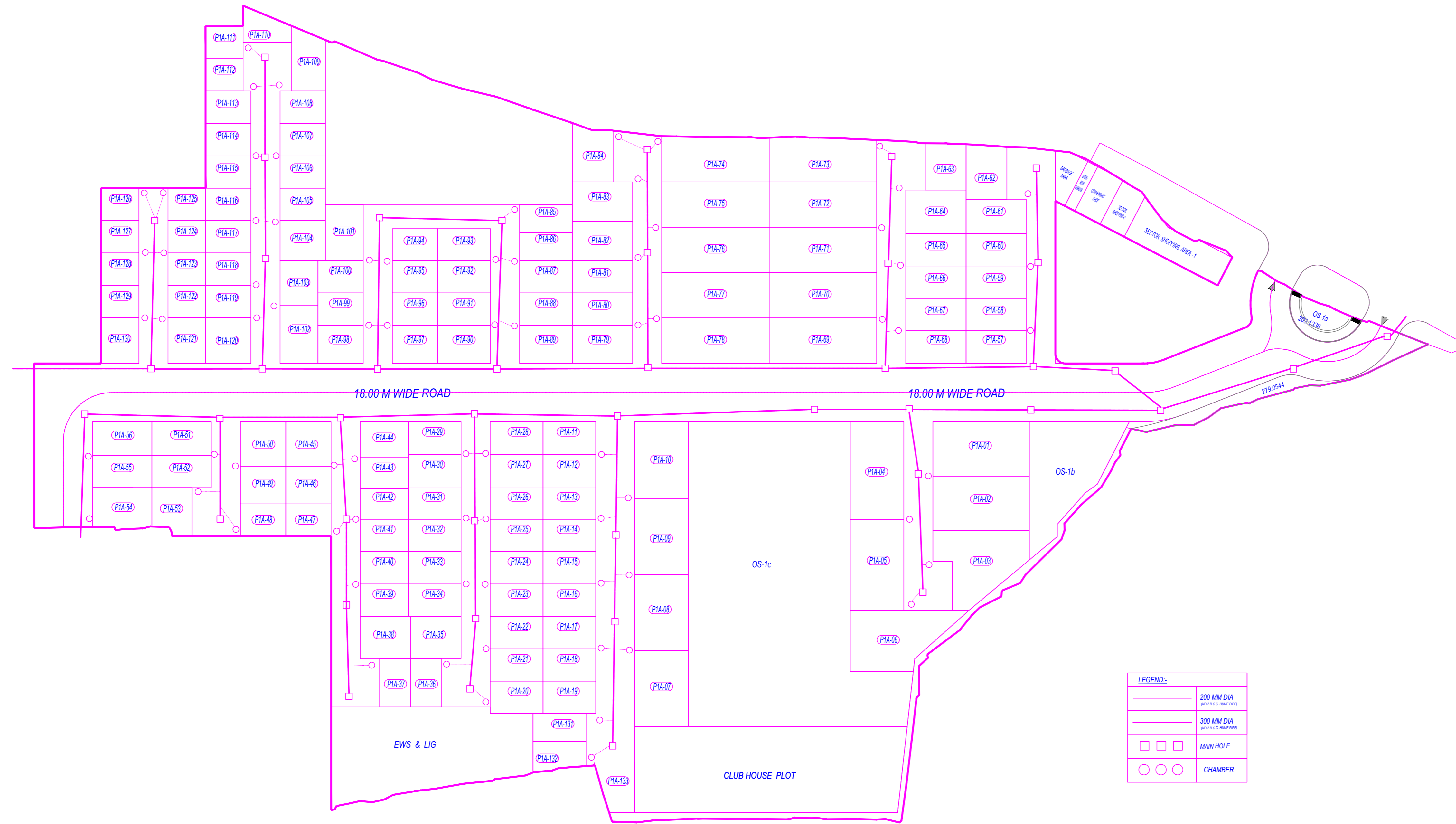
SEWER LINE PLAN