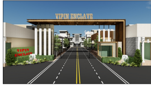
MAIN GATE DESIGN

7.50 M ROAD LENGTH = 295.23 MT. 9.00 M ROAD LENGTH = 445.08 MT. 12.00 M ROAD LENGTH = 185.16 MT.